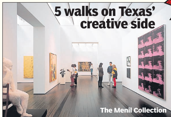
The Menil Collection

1) Art Week Austin What was once the Austin Fine Arts Festival has morphed into a week-long explosion of culture (Apr. 22-26) that celebrates art in a city of art lovers ( artallianceaustin.org ).